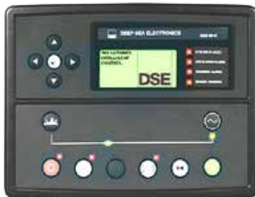
Deep Sea Grid Tie Control for Synchronous Generator