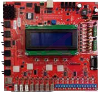
APL Custom Process Control