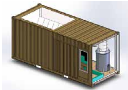
3D CAD Powertainer Alpha