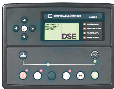
Deep Sea Grid Tie Control Unit