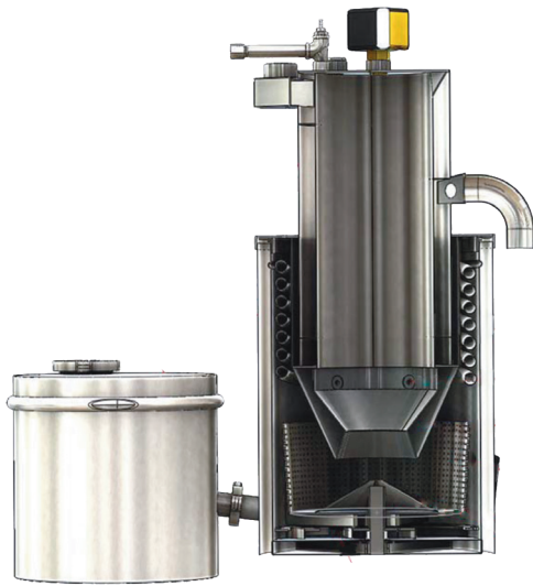
v5 GEK TOTTI Gasifier