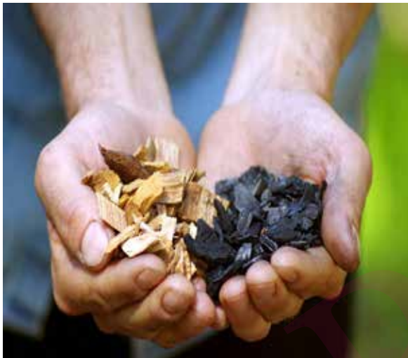
Woodchips into Biochar

All specifications are subject to change without notice