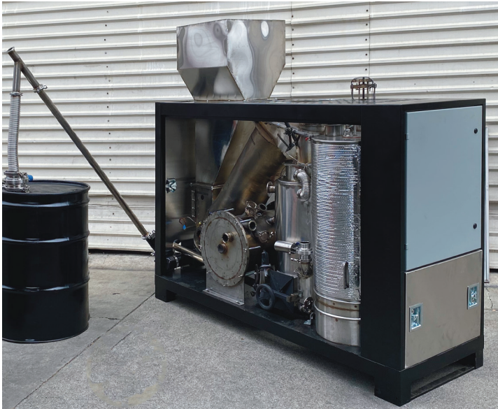
CharPallet 25 Prototype

The ALL Power Labs CharPallet 25 is a smart, compact, Combined Heat & Biochar (CHAB) gasifier system designed to convert 25 kg/hr waste woody biomass into exceptionally high-quality biochar. It is based on our third-generation cracker reactor incorporating APL's major breakthroughs in gasifier architecture. Our v3.0 Swirl Hearth design includes innovations which greatly widen the range of acceptable feedstocks, minimize feedstock preparation requirements, and nearly eliminate biocarbon contaminants. Optimized for unprecedented biocarbon throughput and quality, it outputs quasi-activated, quasi-graphenated, biocarbon with Geo-Conducting properties.